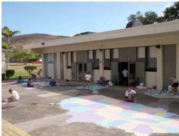
Lions and school volunteers work together to paint the map of the world at Kaelepulu Elementary School