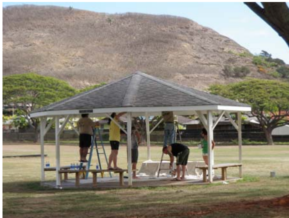
The gazebo in the park next door also received another coat of paint from the hard working Lions and volunteers